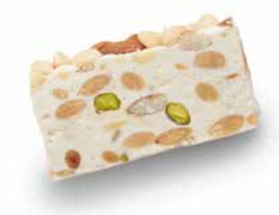
FLEUR DE SEL 21150