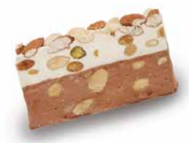
VANILLA & COCOA