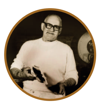
Maître Nougatier since 1926

Available in bites, bars, bags and boxes. Naturally without gluten, dairy, peanut, soya, etc.